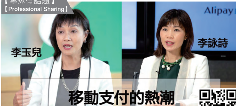
香港移動支付邁新時代 A new era of mobile payment