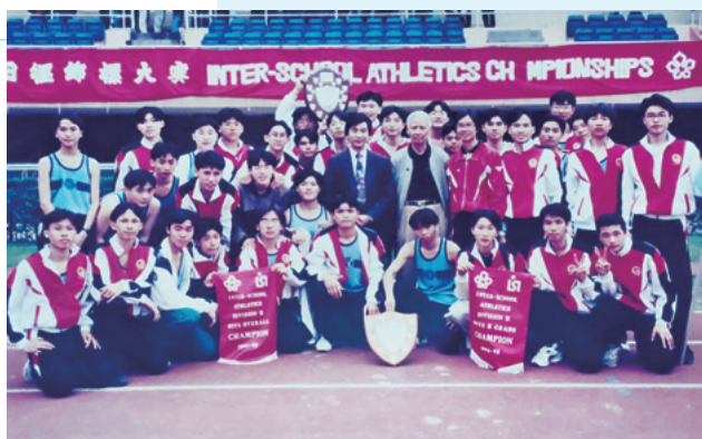
1994年田徑隊奪得第二組別總冠軍，團體合照。 In 1994, CMA's Track and Field Team won the Championship of Division 2.