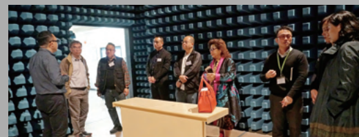
CMA檢定中心參觀 CMA Testing Visit 日期 Date : 待定(TBC) 查詢電話 Enquiry Hotline : 2851 1555