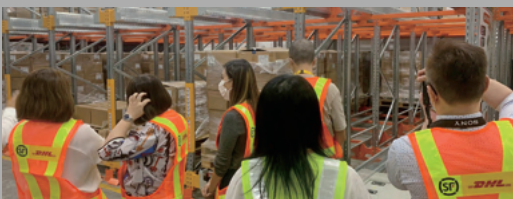
廠商會考察團 CMA Mission 日期 Date : 12月中旬 Mid of December 查詢電話 Enquiry Hotline : 2851 1555