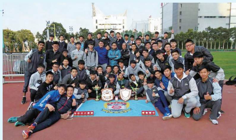
2017年奪得第二組總冠軍，次年重回港九第一組作賽 In 2017, CMASS won the championship in Division 2 and thus could return to Division 1 of Hong Kong Inter-Secondary School Competition the following year.

Although the epidemic has not yet dissipated, members of our Track and Field Team have taken the initiative to vaccinate, demonstrating sportsmanship and strong will. In order to resume training and continue to adhere to the "Hell programme". Definitely, our students are no slackers, but are actively preparing for the battle, for the purpose of winning the crown in Hong Kong Inter-Secondary School Competition, and to win the glory for the school, teammates and themselves.