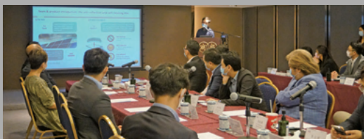
廠商會「在商『研』商」交流會 Bring Tech to Business 日期 Date : 待定(TBC) 查詢電話 Enquiry Hotline : 2851 1555