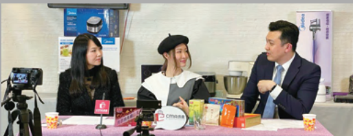
「CMA良倉」吃貨攻略Live Show CMA E-warehouse Live Show - Foodie's Guide 日期 Date : 12/11/2021 查詢電話 Enquiry Hotline : 2851 1555