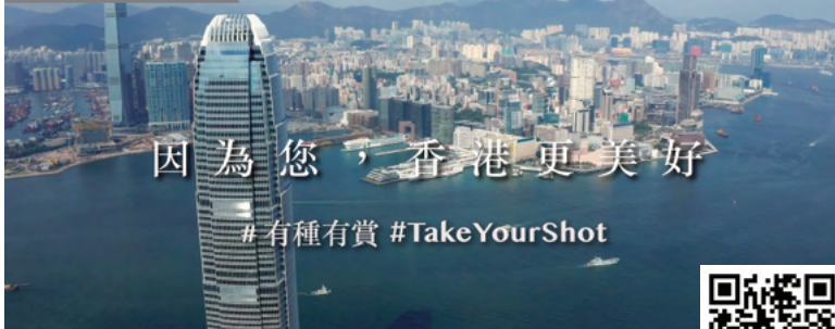
廠商會「有種·有賞」疫苗獎賞計劃 CMA "Take Your Shot" incentive campaign highlights